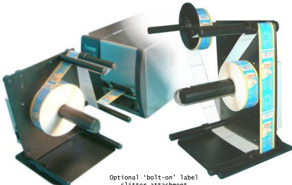
Optional 'bolt-on' label slitter attachment